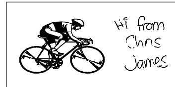
Sample image #2