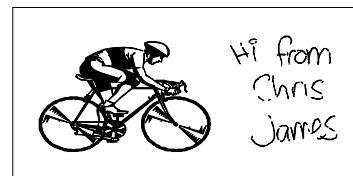
Sample image #2