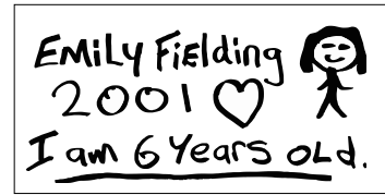
Sample image #1