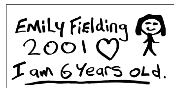
Sample image #1