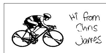
Sample image #2